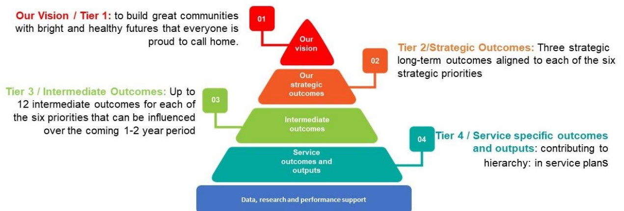
Figure 1 – Mid Suffolk Theory of Change